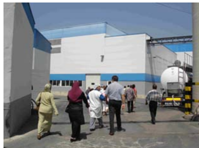
The group visits a dairy factory in Catalonia

The objective of this seminar was to facilitate the application of pollution prevention alternatives by means of improving the ecoefficiency of production processes and thus, contributing to the effective reduction of pollution generated by one of the key sectors in the Mediterranean region: the milk and dairy products industry.