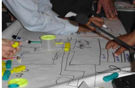
Managing the Fun Factory

During 11-16 July 2005, an advanced seminar on pollution prevention in the dairy industry took place in Barcelona. 21 representatives from the civil service and technicians from the following countries participated in the seminar: Albania, Algeria, Bosnia and Herzegovina, Egypt, Jordan, Lebanon, Morocco, Mauritania, the Palestinian Territories and Tunisia.