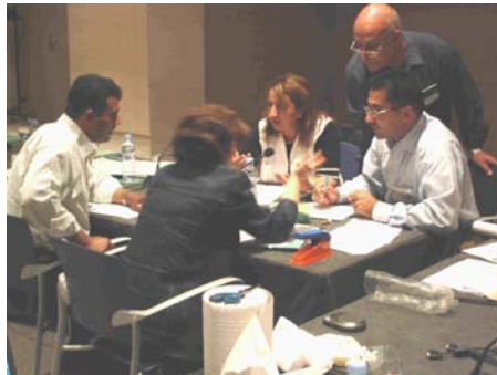
Working group discussing during one of the practical activities of the seminar

The seminar was organised by the Centre for the Enterprises and the Environment (CEMA), the Catalan Agency for Development Cooperation (ACCD) and the Spanish Agency for International Cooperation (AECI). This is the second initiative that CEMA has undertaken within the framework of the Azahar Programme, which is a Spanish cooperation programme for development in the Mediterranean with regard to sustainable development, environmental protection and preservation of natural resources.