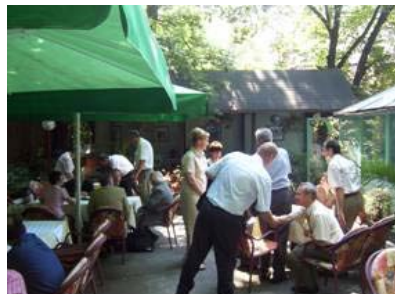
Lunch break at the "Dom Pisaca" restaurant in Sarajevo

The final consulting seminar within the POEMS-BiH project (Capacity Building for implementation of Environmental Management Systems according to ISO 14001 in Bosnia and Herzegovina) was held on 8 July 2005, in Sarajevo, organized by the Centre for Environmentally Sustainable Development. On this occasion, the certificates have been awarded to the representatives of industries participating in the project implementation, as well as letters of thanks to the individuals and organizations that supported the project.