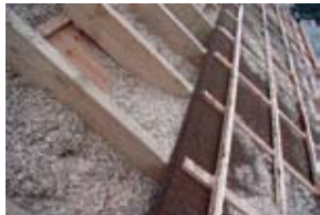
→ The most common domestic insulators, such as glass wool, mineral wool and foam, are industrially manufactured. And yet agriculture is a source of plant and animal-origin materials –hemp, coir, linen, felt, wool– that are just as efficient and less damaging. www.designinggreen.com