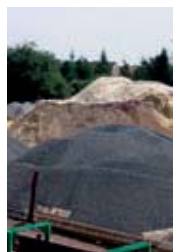
→It takes between 100 and 300 tonnes of gravel and sand to build a house.

Concrete, a basic building material used for two-thirds of housing, is especially polluting. Once mined, the combination of limestone and clay must be fired at over 1,500°C then ground. Both these operations necessitate large amounts of energy: it takes 100 kg of coal to produce one tonne of clinker (concrete before grinding). While most of the time these operations use fossil fuels, they are increasingly being replaced