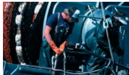
↓ Agriculture, fishing and livestock production represent a colossal market in economic terms and in terms of employment.

Soil degradation causes a substantial reduction in the land's production capacity. Mismanaged or overexploited, almost 40% of farmland is now in a state of reduced fertility. As a result, 5 to 6 million hectares of cropland are abandoned in the world each year. Overproduction, inadequate land and water management, deforestation, desertification, the absence of crop rotation, excessive recourse to fertilizers and other chemical products, as well as the use of unsuitable