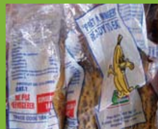
↓ In industrialized countries, dustbins are almost 3/4 filled with food packaging.

of wild fish are ground into meal to produce 1 kg of farmed fish